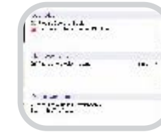
TASKS & REMINDERS