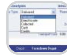
DROP DOWN MENUS